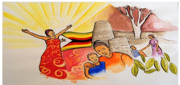
Beaconsfield United Church – Friday March 6, 2020 202 Woodside Road – cross street Sherbrooke

We are empowered to take up our mats. No more waiting powerlessly on the mat. As expressed in the WDP 2020 painting by Nonhlanhla Mathe, let us give a healing hand to the needy, let us embrace children with love as their future is ahead, and let us open our arms in joy as the time to rise up has come. This is the time for change!